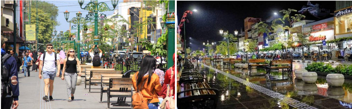
Figure 1. The new Malioboro Walking Street of Yogyakarta