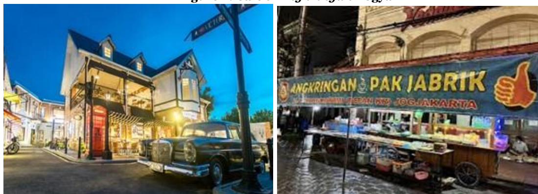
Figure 2. Café & Angkringan Yogya