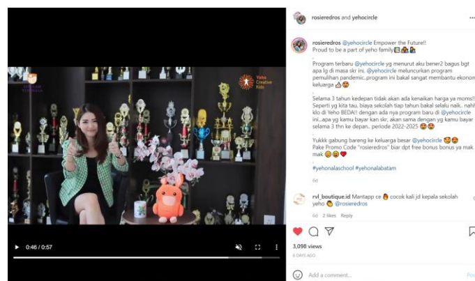
Figure 2. Parent's Testimonial on Yehonala School's Instagram