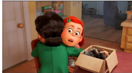
Image 8. Scene from the film "Turning Red" (36.10-37.42)

The myth in this scene is that parents often feel that when their child faces a problem similar to what they experienced, the solution taken is the same as the solution to their past issues.