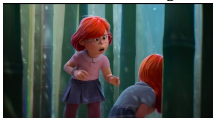
Image 16. Scene from the film "Turning Red" (82.00-83.30)

The myth in this scene is that parents may not be aware that one reason for their child's lies is their overly protective attitude, which can make the child reluctant to be honest.