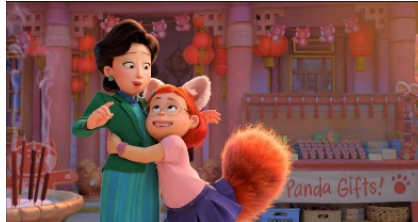
Image 20. Scene from the film "Turning Red" (87.32-88.30)

The myth in this scene is that Mei and her mother are trying to resolve the conflict using conflict resolution strategies of "fighting actively" and talking.