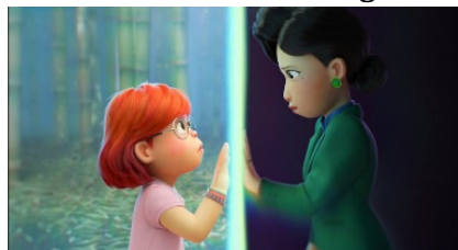
Image 19. Scene from the film "Turning Red" (85.22-86.16)