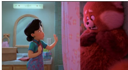
Image 11. Scene from the film "Turning Red" (16.50-18.36)

The myth in this scene is Mei's mother ignoring Mei's explanations and drawing her conclusions according to the reality she wants. Listening is essential for maintaining and developing interpersonal relationships, but Mei's mother seems to lack that ability.