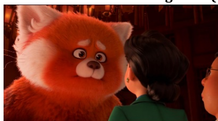
Image 7. Scene from the film "Turning Red" (22.18-29.50)

The myth in this scene is that parents have great love and concern for their children, but their way of expressing concern often goes astray, making the child uncomfortable like Mei, who chooses to ignore her mother.