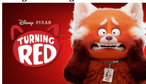
Image 1. Turning Red Movie Poster