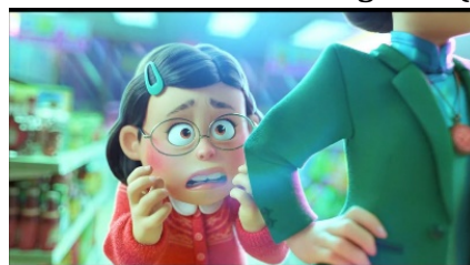
Image 5. Scene from the film "Turning Red" (13.00-14.05)