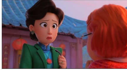
Image 12. Scene from the film "Turning Red" (48.15-49.20)