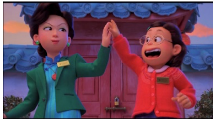
Image 4. Scene from the film "Turning Red" (08.10-09.25)

Mei's monologue about her mother influencing many of her decisions also indicates her mother's authoritarian parenting style. Similarly, Mei's reaction after her mother disapproves of Mei's favorite band, 4-TOWN, through her tone changing unfriendly when the advertisement about 4-TOWN appears on TV. Mei is forced to abandon her intention to express her interest in front of her mother to respect her mother's opinion.