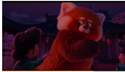
Image 17. Scene from the film "Turning Red" (66.12-71.11)

transmission of Mei's mother's authoritarian parenting style to Mei, as she experienced the same challenges in her youth due to her parents' parenting style.