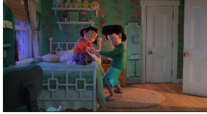
Image 10. Scene from the film "Turning Red" (12.43-13.00)