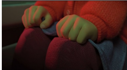
Image 13. Scene from the film "Turning Red" (14.05-14.20)