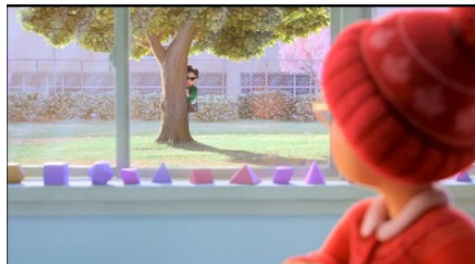
Image 6. Scene from the film "Turning Red" (22.20-23.30)

The myth in this scene is that parents tend to believe their children are always right. Therefore, Mei's mother refuses to listen to Mei's and the man's explanations because she thinks she knows Mei very well. She trusts that Mei is a good and innocent child, so the fault must lie with the man.