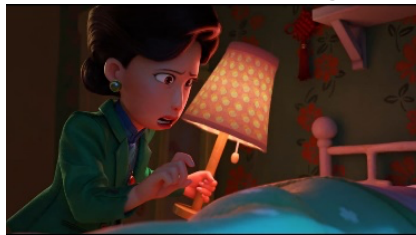
Image 15. Scene from the film "Turning Red" (55.50-56.30)

The myth in this scene is that a child, even when upset and disagreeing with their parents' decisions in an authoritarian upbringing, is forced to comply. Similarly, the strained relationship between parents and children is often perpetuated across generations, as seen in Mei's mother's relationship with Mei's grandmother.