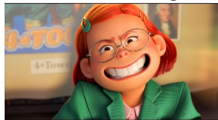
Image 14. Scene from the film "Turning Red" (38.01-40.00)

The myth in this scene is that Mei's clenched fist suggests her reluctance to express her true feelings to her parents. Openness between a child and parents creates effective communication, and Mei's closed-off demeanor hinders their communication effectiveness.